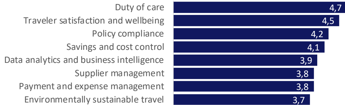
Travel program priorities, April 2021

Duty of care is the top travel program priority steadily leading the travel managers' ratings in 2020-2021. A similar picture emerges for traveler satisfaction and wellbeing – its importance has stayed high throughout.