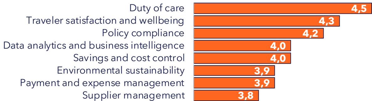
Travel program priorities, Oct. 2021

Rated 4.5, Duty of care remains at its leading position in travel buyers' latest assessment of their program priorities. Traveler satisfaction and wellbeing follows closely – its importance has been high throughout 2020-2021.